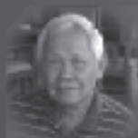
Moque Dillo RC Las Pintas South